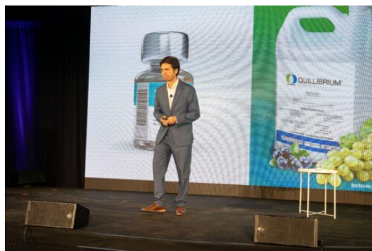
BSI CEO Gastón Salinas.

The company reports Quillibrium saw a growth of more than 50% year-over-year of effective growers' adoption in Chile and Peru, according to a news release. More than 100,000 acres have been treated with Quillibrium.